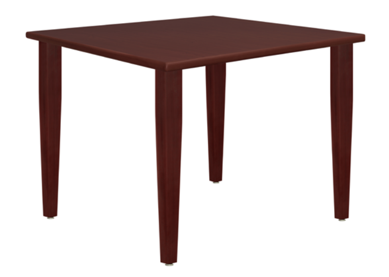
Model: 30562BH 42W 42D 29.75H 28.5 Clearance Height

Benessere Shaker Behavioral Dining Table legs are constructed with steel reinforcement, completely tamper-proof and available in standard and wheel chair heights. The Shaker style features a classic tapered shape design and may be mounted to the floor.